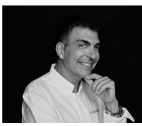
Ramón Freixa. Castellfollit de Riubregós, 1971.

“My work is based on tradition and I experiment to create new recipes that surprise and, above all, that people like”. Ramón has not ceased to explore every territory in search of the best product, from the simplest to the most sophisticated. Always the centre point of his cuisine, he is now bringing it on board the trains.