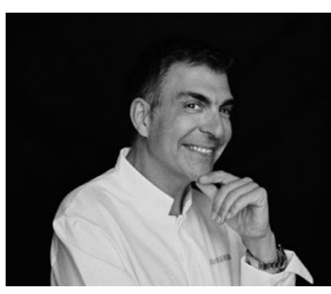
Ramón Freixa. Castellfollit de Riubregós, 1971.

“My work is based on tradition and I experiment to create new recipes that surprise and, above all, that people like”. Ramón has not ceased to explore every territory in search of the best product, from the simplest to the most sophisticated. Always the centre point of his cuisine, he is now bringing it on board the trains.