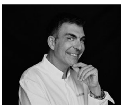
Ramón Freixa. Castellfollit de Riubregós, 1971.

“My work is based on tradition and I experiment to create new recipes that surprise and, above all, that people like”. Ramón has not ceased to explore every territory in search of the best product, from the simplest to the most sophisticated. Always the centre point of his cuisine, he is now bringing it on board the trains.