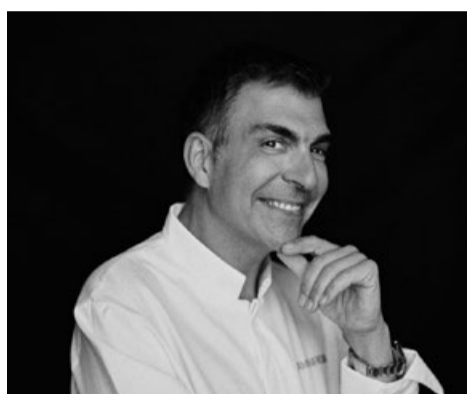
Ramón Freixa. Castellfollit de Riubregós, 1971.

“My work is based on tradition and I experiment to create new recipes that surprise and, above all, that people like”. Ramón has not ceased to explore every territory in search of the best product, from the simplest to the most sophisticated. Always the centre point of his cuisine, he is now bringing it on board the trains.